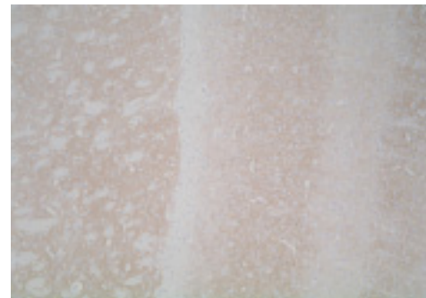
Sample : Mouse cerebrum (paraffin section)