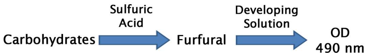
Figure 1. Total Carbohydrate Assay principle.

Cell Biolabs' Total Carbohydrate Assay Kit measures total carbohydrate within food samples, urine, serum, plasma, lysate, or tissue samples based on the phenol-sulfuric acid method. Carbohydrates are hydrolyzed to furfural and other derivative forms in the presence of sulfuric acid. Upon addition of Developing Solution, a chromogen is formed that can be detected at 490 nm (Figure 1).